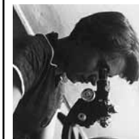
ROSALIND FRANKLIN Biochemist, UK (1920-1958)